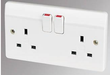
Screwfix 13A 2-GANG DP SWITCHED PLUG SOCKET WHITE (15747)