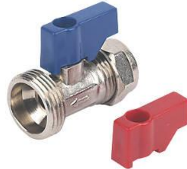
Screw fix Washing machine isolation valve (cold feed) 15MM X 3/4" (51231)

Water filter if you have ordered one looks like this;