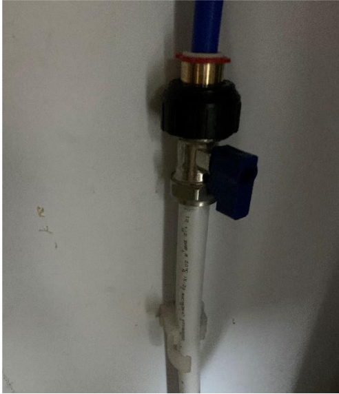
Picture above of what a valve looks like once connected to a coffee machine pipe.